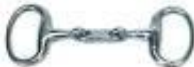
French Link snaffle