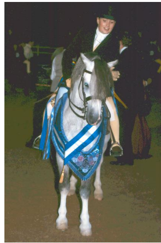
Rebecca Jarvis-Broad riding Sunwillow Jubilee at SWPA 2010

The men would similarly wear long black jacket, teamed with black trousers or they would wear full hunting regalia, as seen in the pictures below.