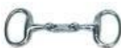
French Link snaffle