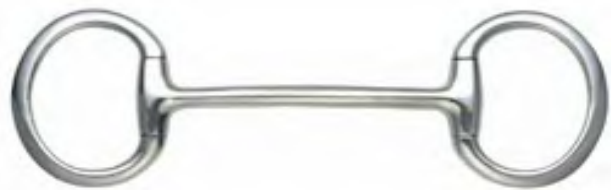
Mullen mouth snaffle