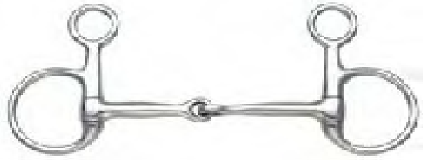
Baucher snaffle – hanging cheek